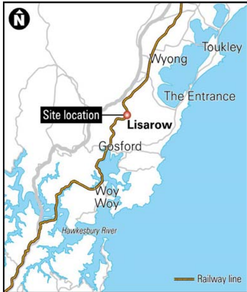
Figure 1: Site location plan