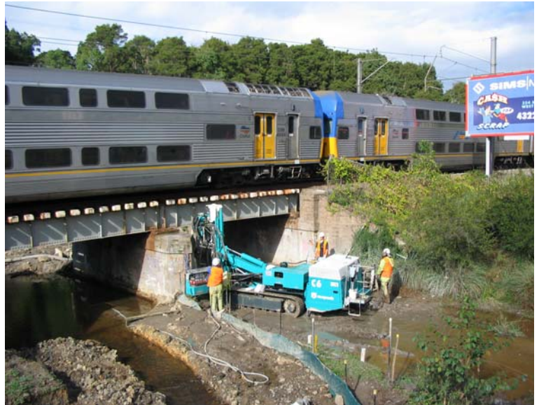
Figure 2: Previous bridge showing jet grout installation