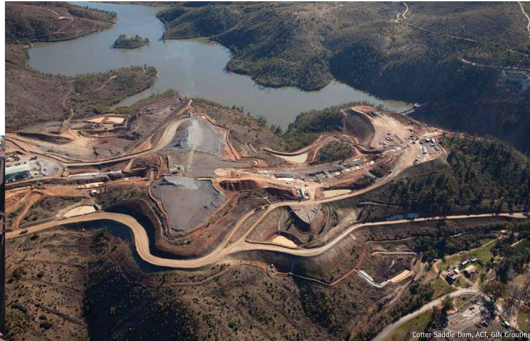
Cotter Saddle Dam, ACT, GIN Grouting