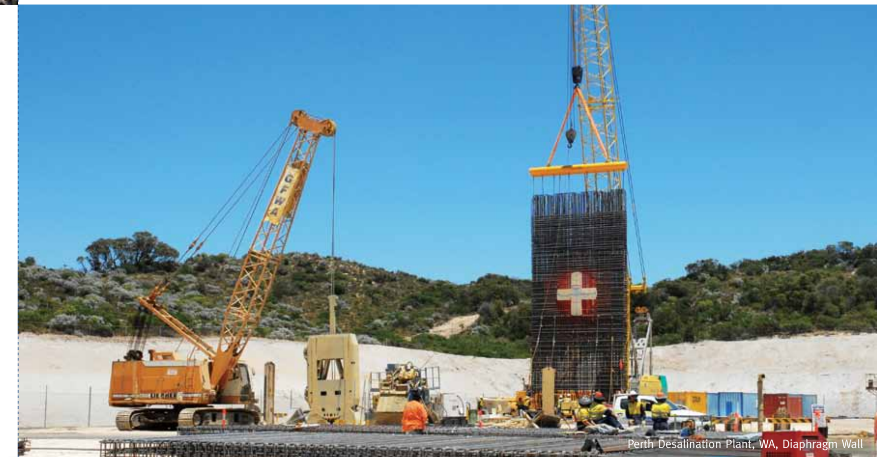
Perth Desalination Plant, WA, Diaphragm Wall