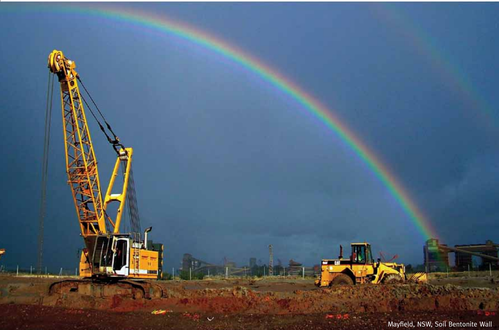
Mayfield, NSW, Soil Bentonite Wall