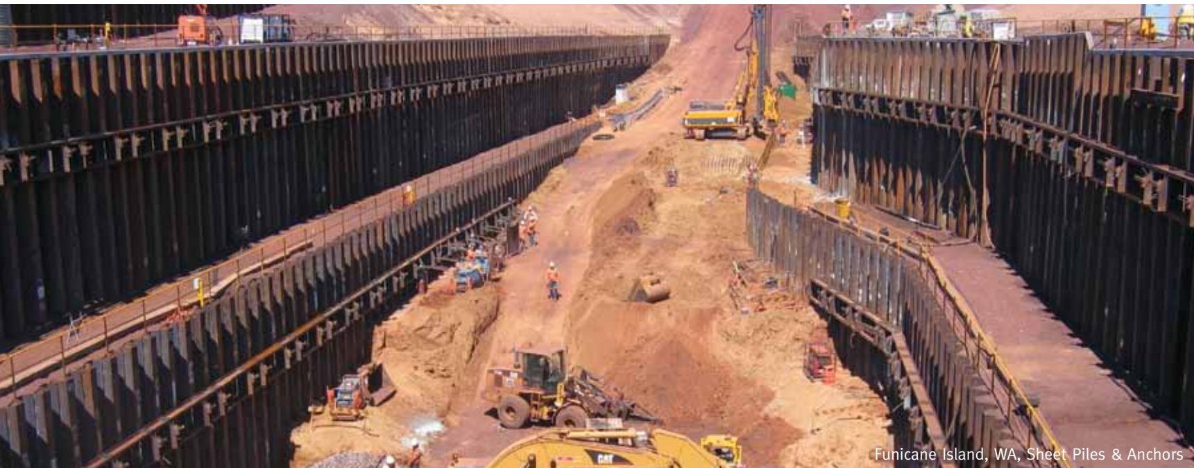
Funicane Island, WA, Sheet Piles & Anchors

Menard Bachy is a leading specialist geotechnical contractor operating throughout Australasia, and the South Pacific region with a reputation for quality, innovation and engineered solutions. As a subsidiary of the international Soletanche Freyssinet Group, a specialist contracting company and a world leader in geotechnical, environmental and civil engineering construction, Menard Bachy offers local expertise supported by a global network of unparalleled resource and experience.